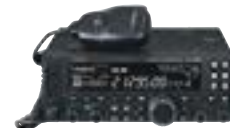
FT-450D 100W HF + 6M Transceiver